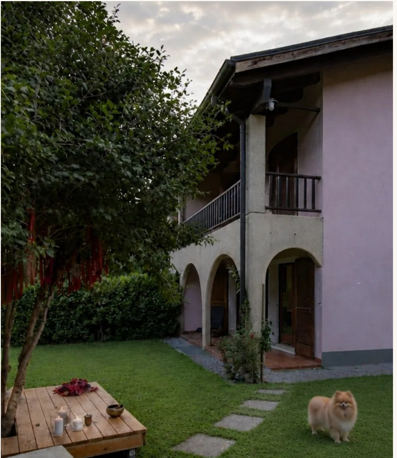
THE GARDEN AT BLUE HOUR — CASA ORTENSIA, MONTEGGIO