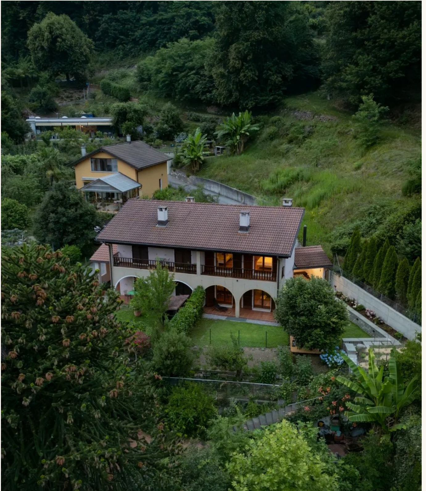
CASA ORTENSIA, FROM ABOVE — MONTEGGIO, MALCANTONE